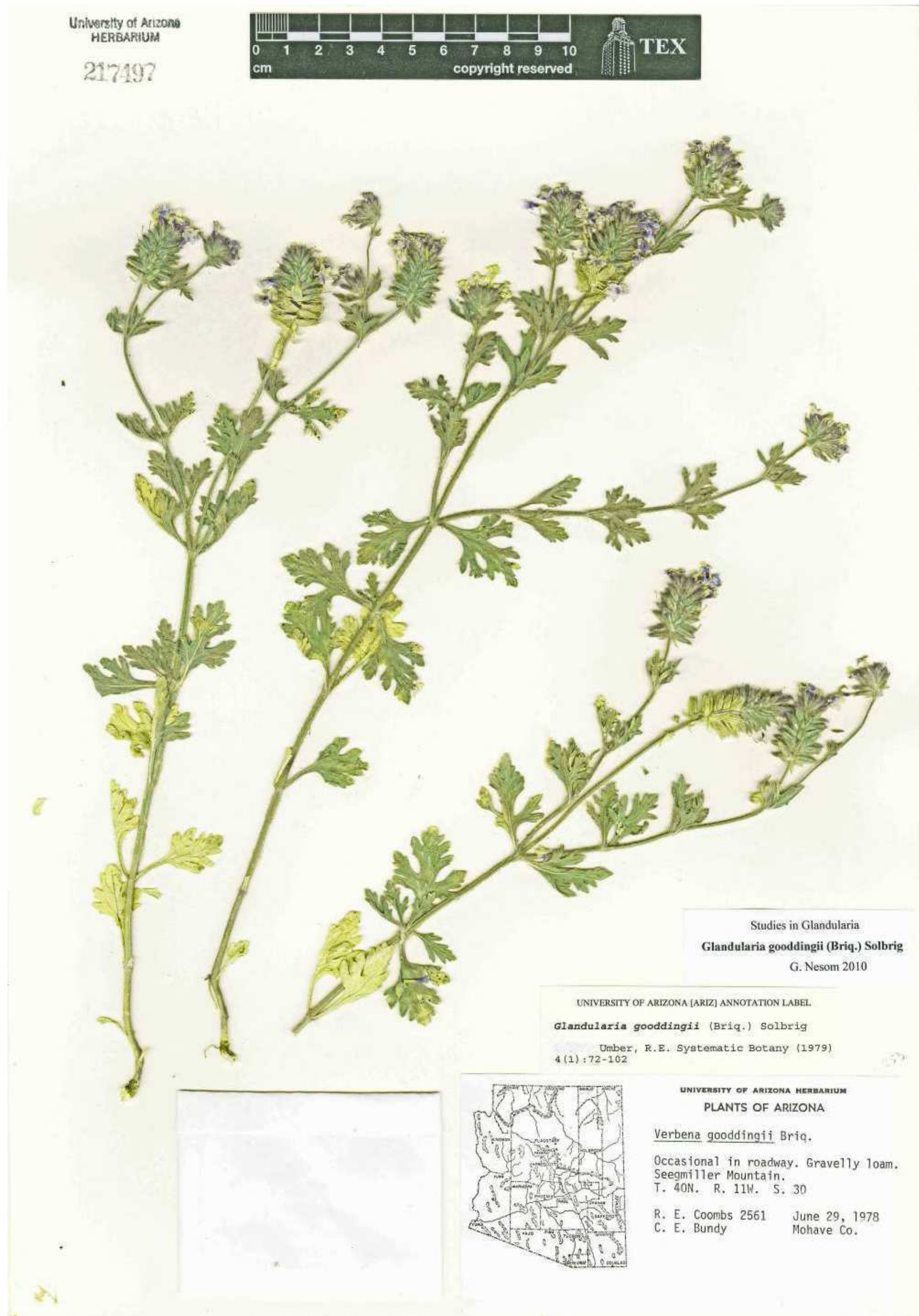
Figure 5. Glandularia gooddingii , leaves dissected.